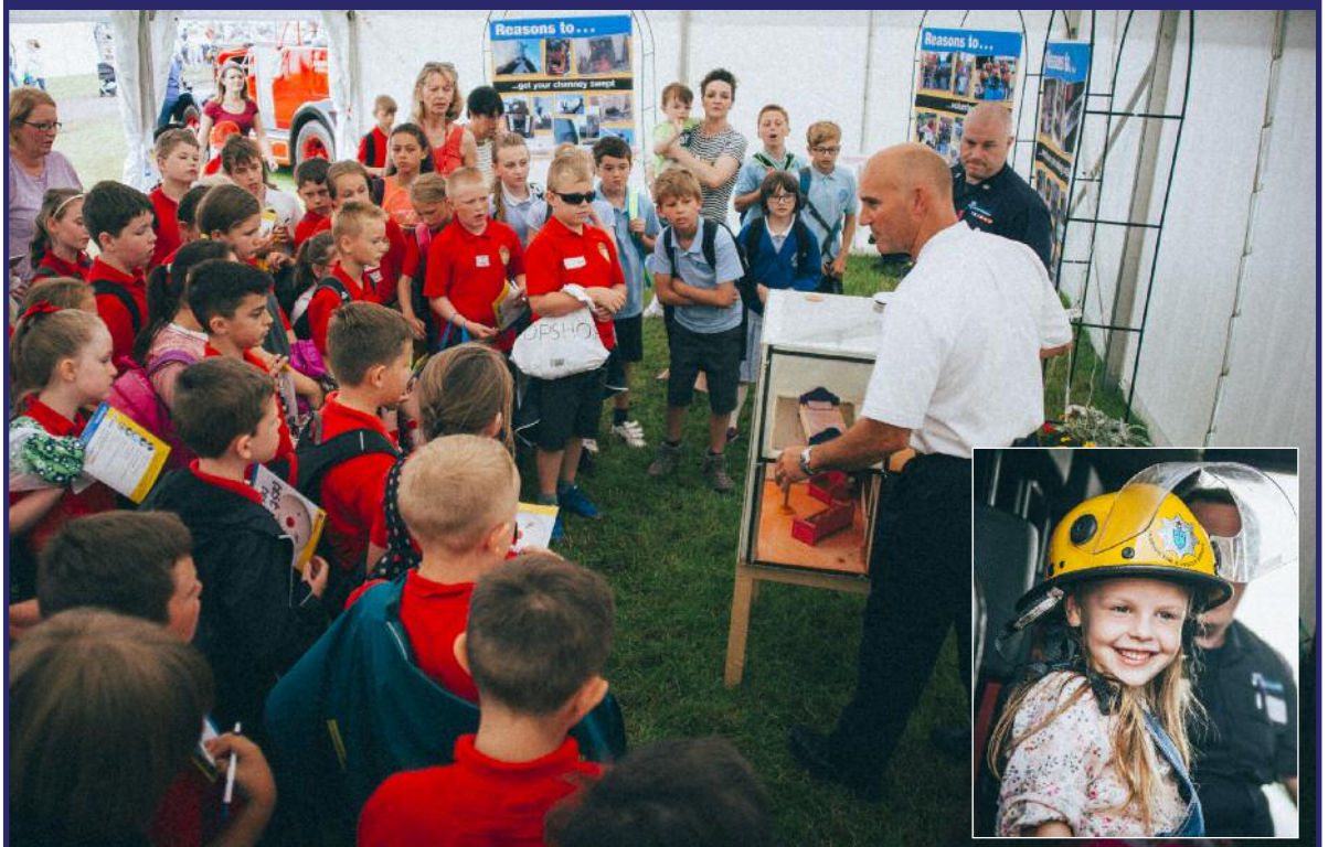
Over the past year we have engaged with thousands of people across Cheshire in a bid to keep people safe in their home and on the road. This engagement included school visits, community events and station open days.